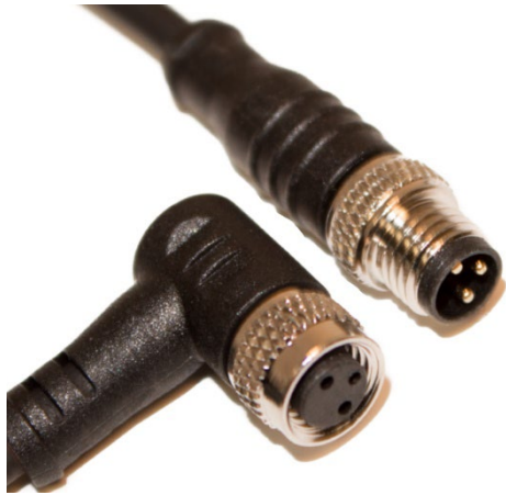
MALE FACE VIEW

(M8 Cordset, 3 Position, 24 AWG Unshielded PVC, Male Straight to Female Right Angle)