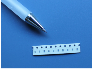
Dimensions (unit: mm)